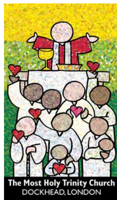
The Most Holy Trinity Church DOCKHEAD, LONDON

This weekend the second collection will be for MISSIO.