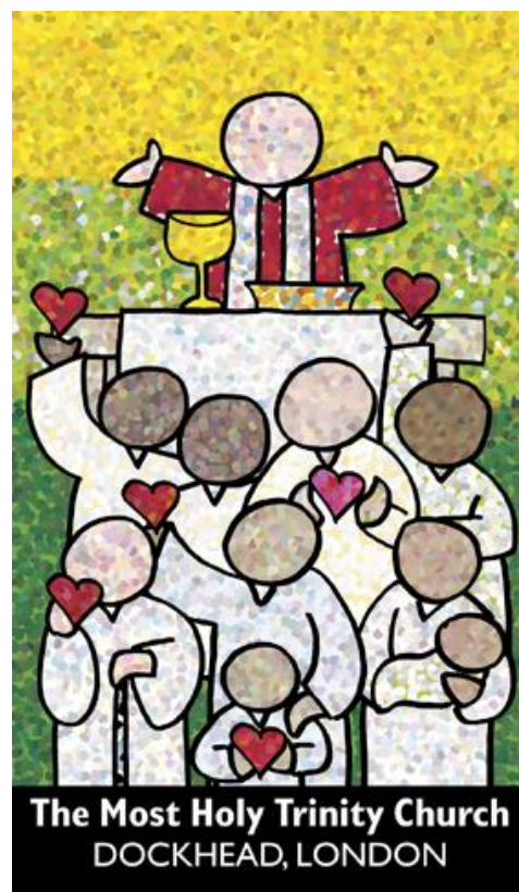
The Most Holy Trinity Church DOCKHEAD, LONDON

Mass on Friday is held in the Convent of Mercy in Parker's Row