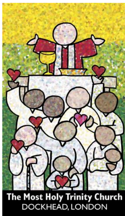
The Most Holy Trinity Church DOCKHEAD, LONDON

Please note that Mass on Friday is in the Convent in Parker's Row